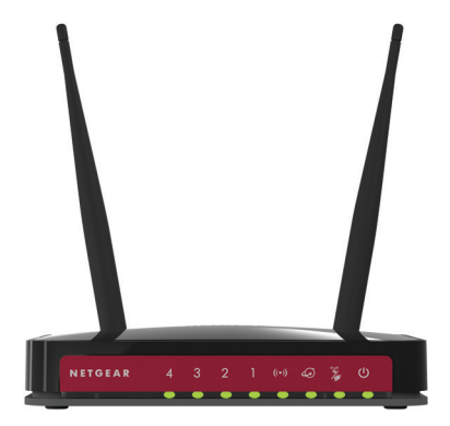
N300 Wireless Router